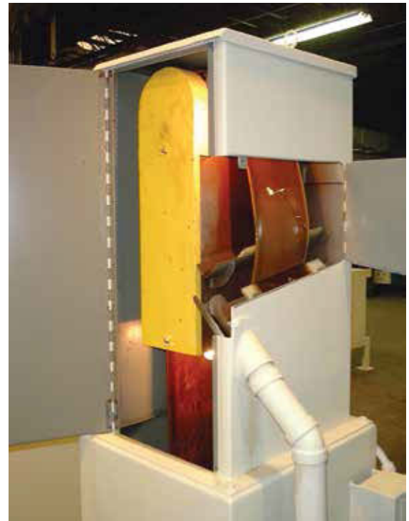
Model BABS/8A/X BABS Unit with 8 inch wide belt