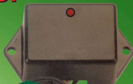
OEM Interface Module